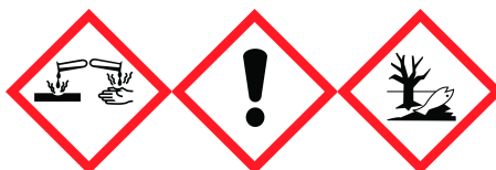
Corrosion Exclamation mark Environment